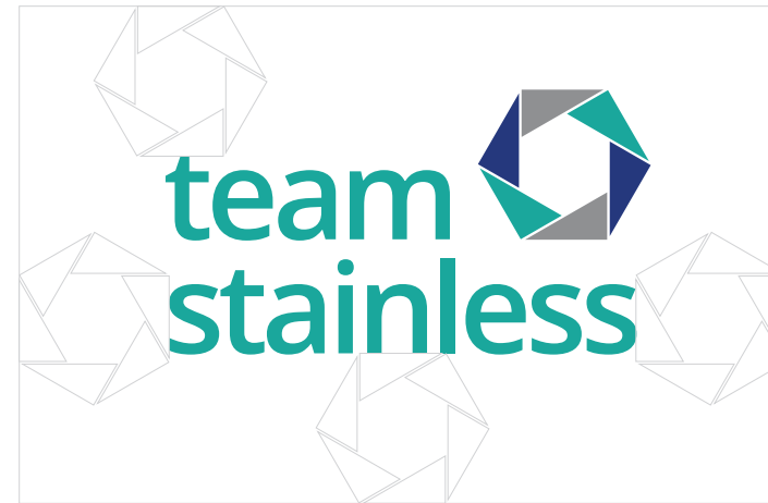
Exclusion zone of standard logo

It is permitted that the icon can be used in isolation to the full logo but only for limited use as a graphical element. This should not be used at a size smaller than 7mm (w) as opposite.